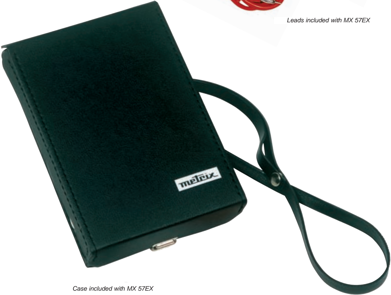
Case included with MX 57EX