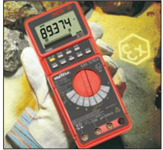
Model MX 57EX used outdoors in a mine.