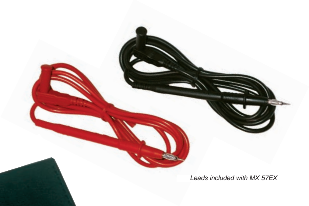
Leads included with MX 57EX