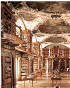
Museums, art galleries

The HygroPalm2-series (with integrated or interchangeable probes) is ideal for all applications where exact measurement of humidity and temperature is of decisive importance, e.g. the food and pharmaceutical industries, printing and paper industries, many trades, the sciences, meteorology, agricultural sector, climatology, etc. There is hardly a field today in which these parameters may be ignored. It is ultimately the measuring task in hand that defines the HygroPalm instrument that best meets your needs.