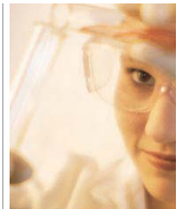
Healthcare, the sciences