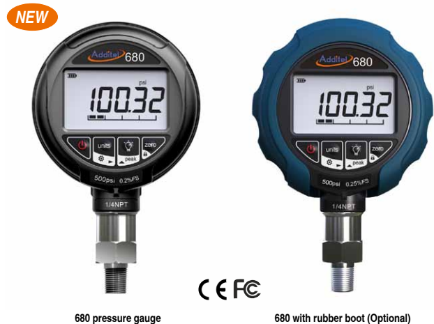
680 pressure gauge