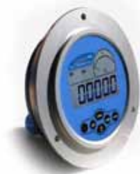
681 Panel mount with back pressure port