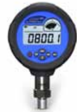
681 with rubber boot