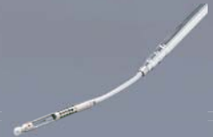
Telescopic, articulating probe