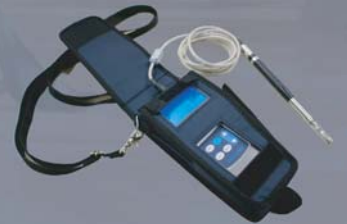
Hands-free Case now available!