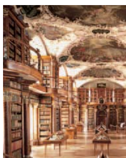
Museums, art galleries

The HygroPalm23-series is ideal for all applications where exact measurement of humidity and temperature is of decisive importance, e.g. the food and pharmaceutical industries, printing and paper industries, many trades, the sciences, meteorology, agricultural sector, climatology, etc. There is hardly a field today in which these parameters may be ignored. It is ultimately the measuring task at hand that defines the HygroPalm instrument that best meets your needs.