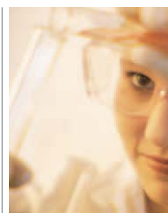
Healthcare, the sciences