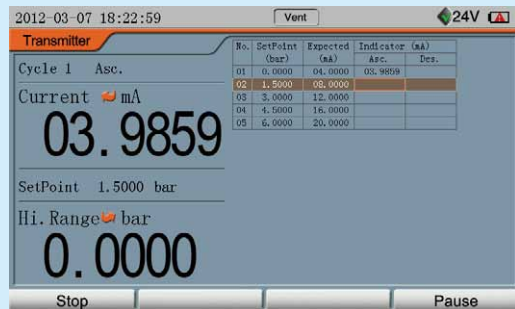
Pressure gauge / transmitter / switch calibration