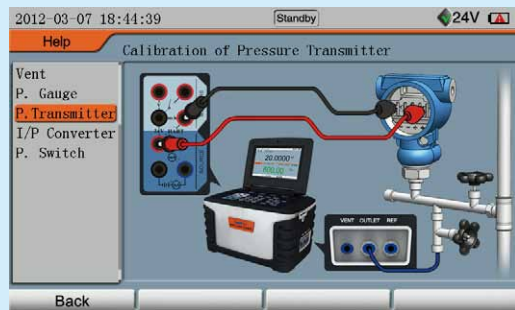
Built-in User's Manual