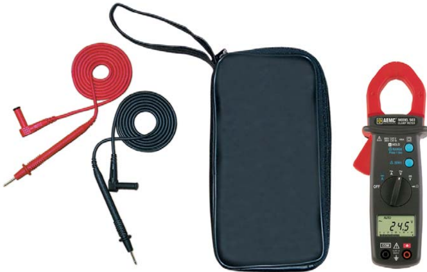
Models 500, 501, 502 & 503 include a pair of test leads and soft carrying case